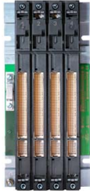
SIMATIC S7-400, rack CR3, central with 4 slots